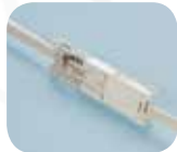
Cable Splices & Taps