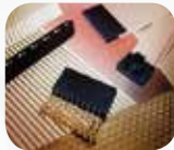
Flat Flexible Cable