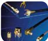
Coax Cable Assemblies