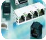
Modular Jacks & Plugs