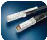
Copper Cable Assemblies