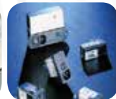
Power Entry Modules