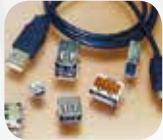
Audio/Video & Data