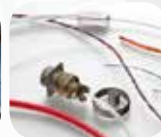
Harnessing & Heat Shrink Harness Components