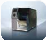
Hardware & Software