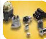
Relays, Contactors & Solenoids