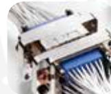
Connectors & Backshells