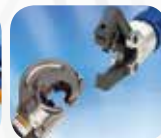
Powered Hand Tools