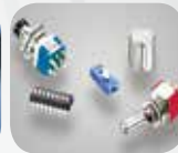
Switches & Knobs