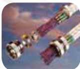
Terminators & Adapters