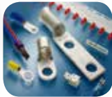
Rings & Spades