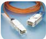
Active Optical Cable Assemblies