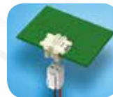
Inverted Thru Board