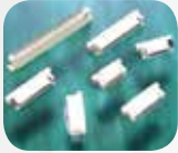
Flexible Printed Circuit