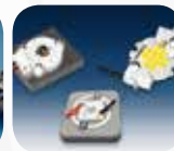
Solderless LED Sockets