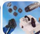
SDE Crimp Tooling