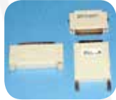
Termination & Connection Devices