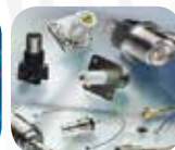
RF & Coax