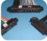
Mixed Power & Signal