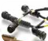
Tubing & Molded