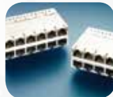
RF & Signal