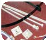
Wrap & Bundling