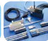
NECTOR Power System