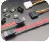
PC & Storage