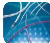
High Performance Wire & Cable