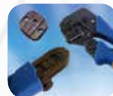
Manual Hand Tools