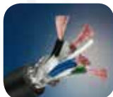
Wire & Cable